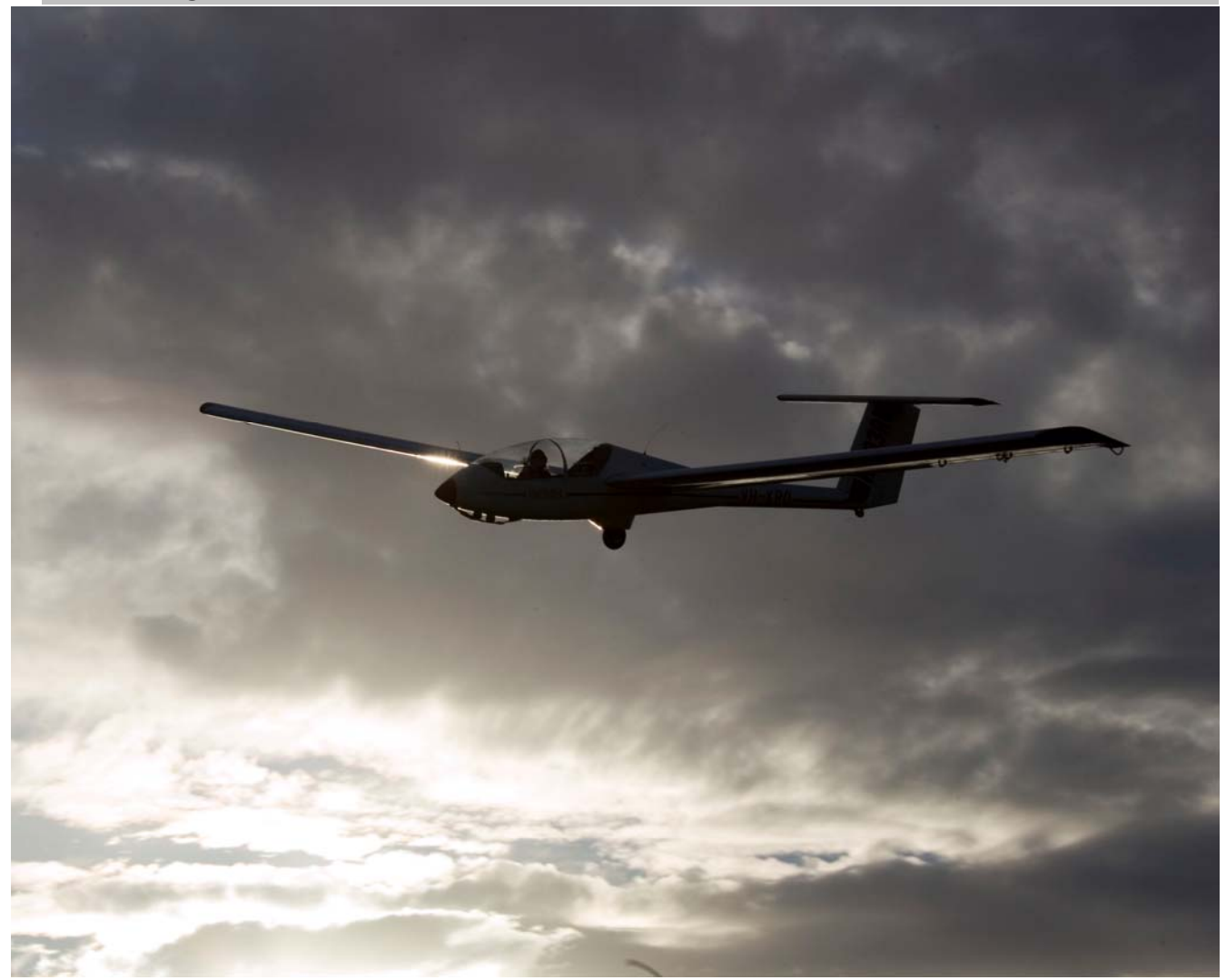
Not really a February picture, but it's pretty cool. I'm in the front seat waving after one of Derek's hangar runs.