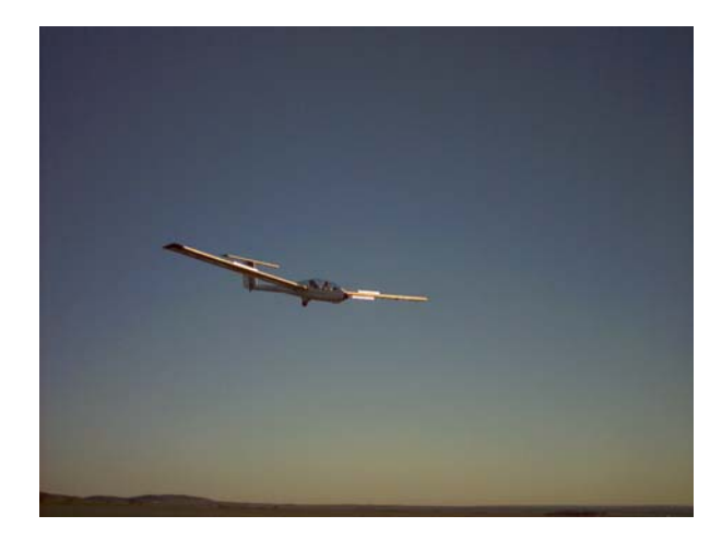
My final approach (looking good).