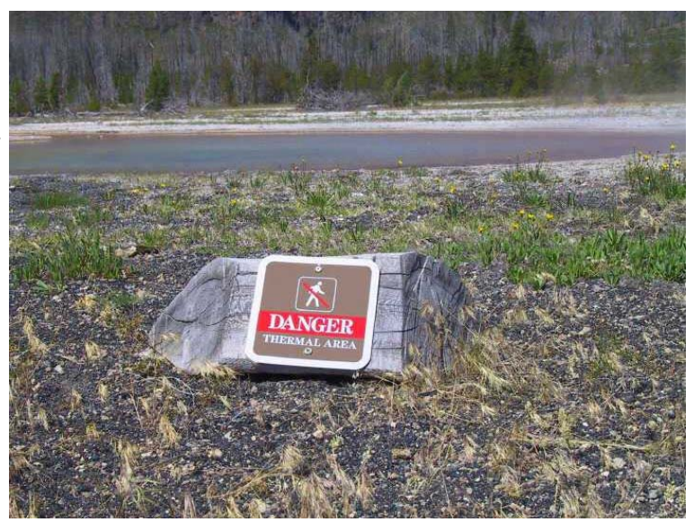
Thermal sign, Yellowstone National Park.