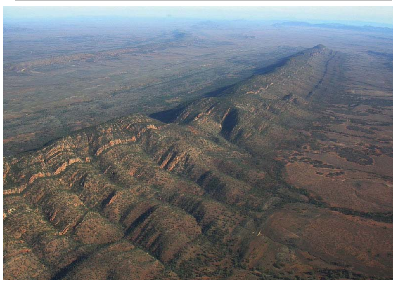
Chase Range in the Flinders Ranges, as seen from ZQ