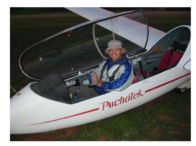
A very happy boy (I lived).