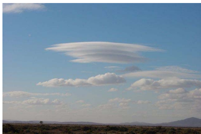
More wave at the Flinders, the day before everyone arrived.

Whilst waiting for the rain at Lochiel to clear last Saturday, the new hangar was cleaned up in readiness for the GFA Safety Seminar, and the broken windows in the current pie cart were replaced with metal sheet salvaged from the new pie cart. Thanks to those who helped out.