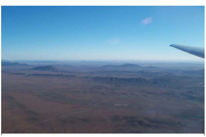
Ranges north of Hawker

The planned flight was to be about two hours long so I would want to have the trim adjusted nicely once we reached our cruise altitude. Unfortunately, the Bergy has only one trim lever and the previous frontseat pilot had accidentally broken it off. During the inspection of the aircraft I convinced myself of two things - there was no way the trim was going to move unintentionally during flight, and there was no way it was going to move intentionally either - it was hard enough to move it on the ground using a tool kit. Nobody really knew what trim setting would be required to aerotow in cruise so I pre-set it at threequarters forward and hoped that would be close enough. Another minor annoyance was that the clear vision window had fallen out of the front canopy some time earlier. Whoever had jokingly put the "airconditioning fitted" sticker on the canopy was not kidding. Nevertheless, the plane was airworthy so it was made ready for the flight.