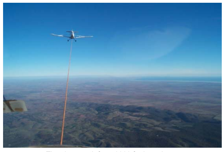
The view south from 6000 ft above Laura

With the tug plane fully fueled and loaded up with all the gear going back to its base, the twin-seater on tow and the windsock dead, this promised to be the slowest launch of the week. To minimise the ground run, it was decided to start from the slightly uphill end of the runway. Naturally, this was the opposite end to our tie-down area and we were running close to the departure time the tug needed to get home before dark. After towing the glider along the strip, we quickly did our standard checks and made last-minute adjustments to the radio frequencies, then we were ready.