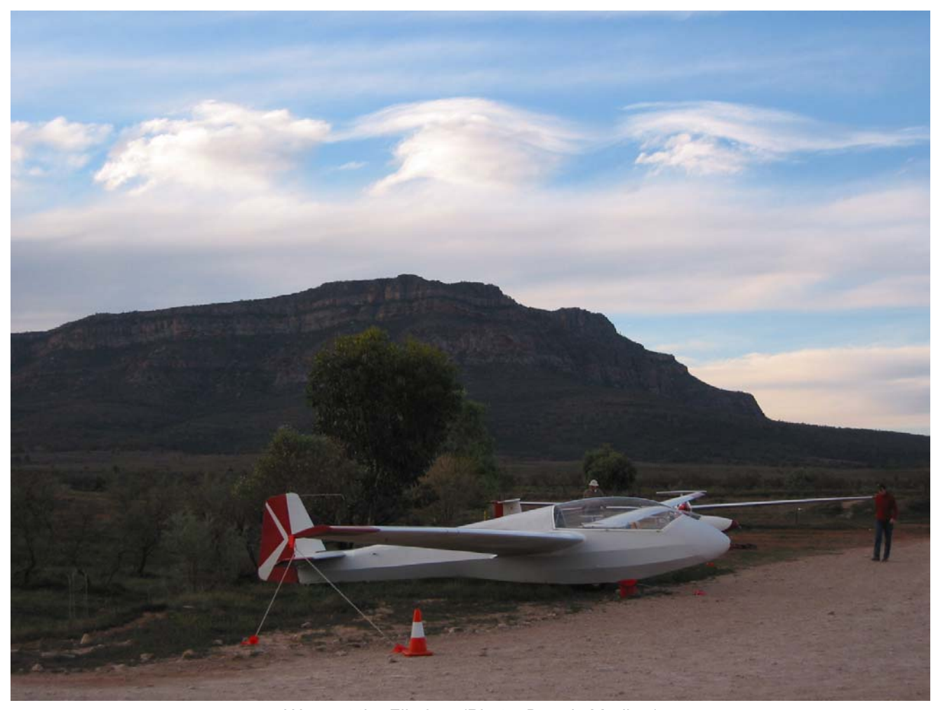
Wave at the Flinders

The Official Journal of the Adelaide University Gliding Club