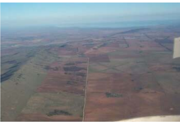
Home in sight

On our arrival at the airfield, the windsocks confirmed that there was a slight south-westerly. There were sheep grazing in "the valley" but the strips were clear. While we burned off some height with steep turns and wing-overs, the wind changed its mind a couple of times and then dropped off entirely so we landed on the strip at the hangar end. The plane was soon back in its hangar and we settled in to await the arrival of our car and retrieve crew.