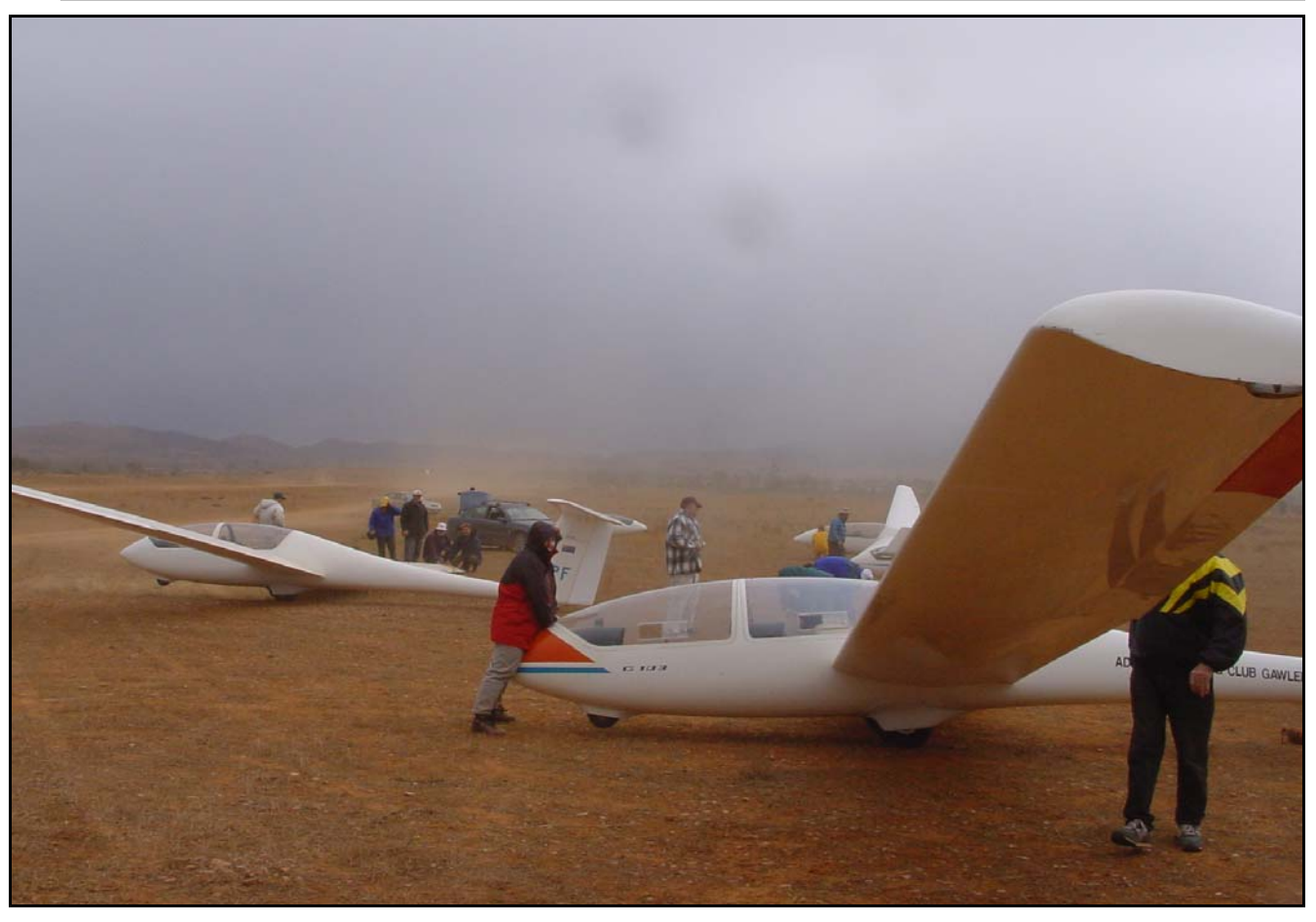
Look at what we have to look forward to on the Flinders Trip. Our weather will be better, honest!