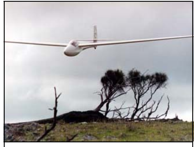
Another Libelle somewhere on the ridge