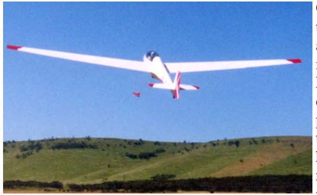
ZQ rotates into full climb on its maiden flight at Lochiel.

Well I can only say that October has been an incredibly busy month. There has been lots and lots of flying going on, even with the reduced number of aircraft available on field. Perhaps the warmer weather is coaxing people back out of their winter hibernation. The shed at West Beach has been all but frantic with both WVA and ZQ being readied for Khancoban as well as good progress on ZM's 30 yearly. Unfortunately all this activity has meant that we have deferred last months executive meeting as well as Part 2 of the strategic planning meeting and of course the newsletter is late. As a result I have cobbled together this partially completed newsletter and published it under the 'Far Cu' title. Of course I am probably the only editor to have 'Far Cu'd himself, usually it is someone else 'Far Cu'ing the editor for being extremely late with the next edition.