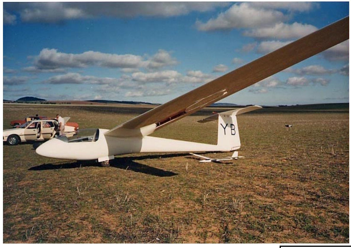
The Phoebus. Note the model glider next to it.

The next photograph shows the first fibreglass glider ever owned by the club. Our 17m open class Phoebus! The Phoebus was blessed with 42:1 performance, but at very slow speed only – but nothing could beat it on a weak day! It also had an all-flying tail – there is a big red lump of lead forward of