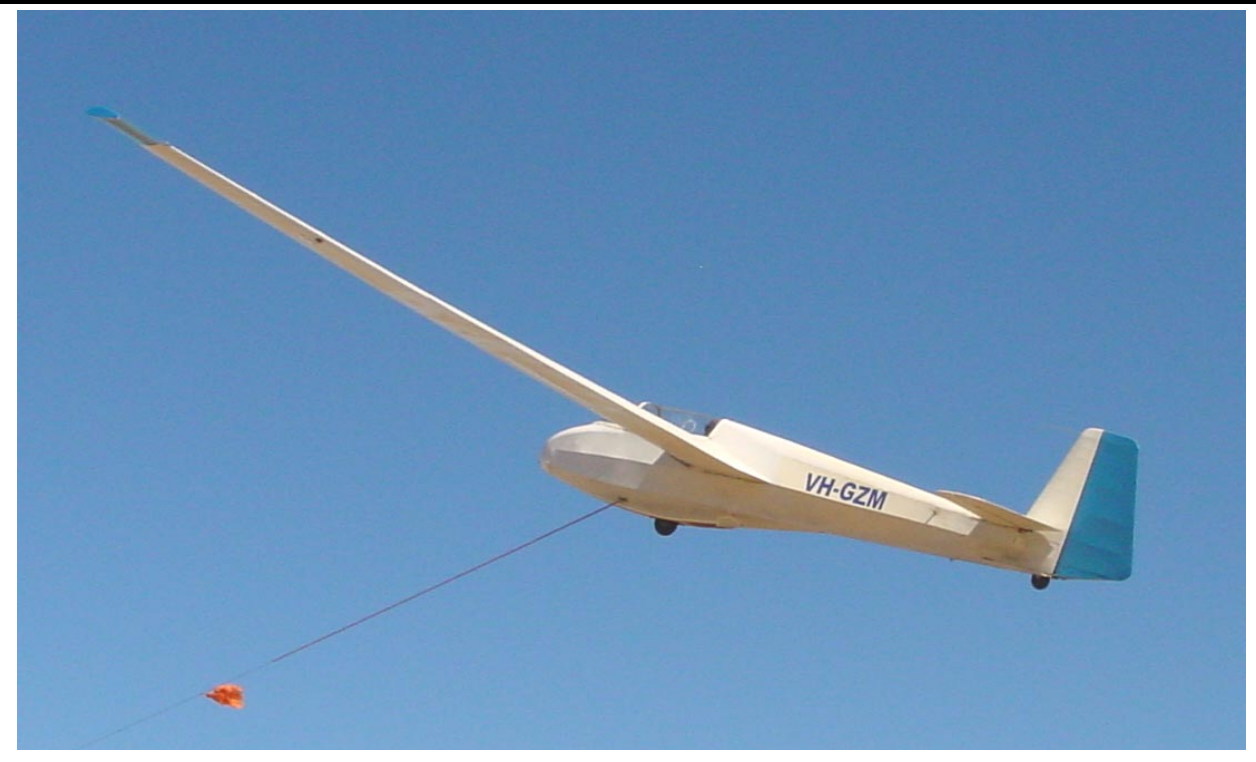
The Bergfalke going up the wire