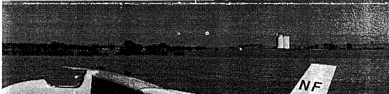
The Adelaide University Gliding Club's Bocian at Lochiel