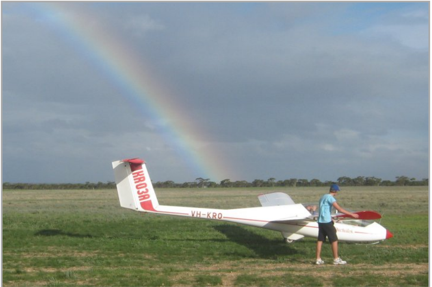
The Puckatek at the end of the rainbow.