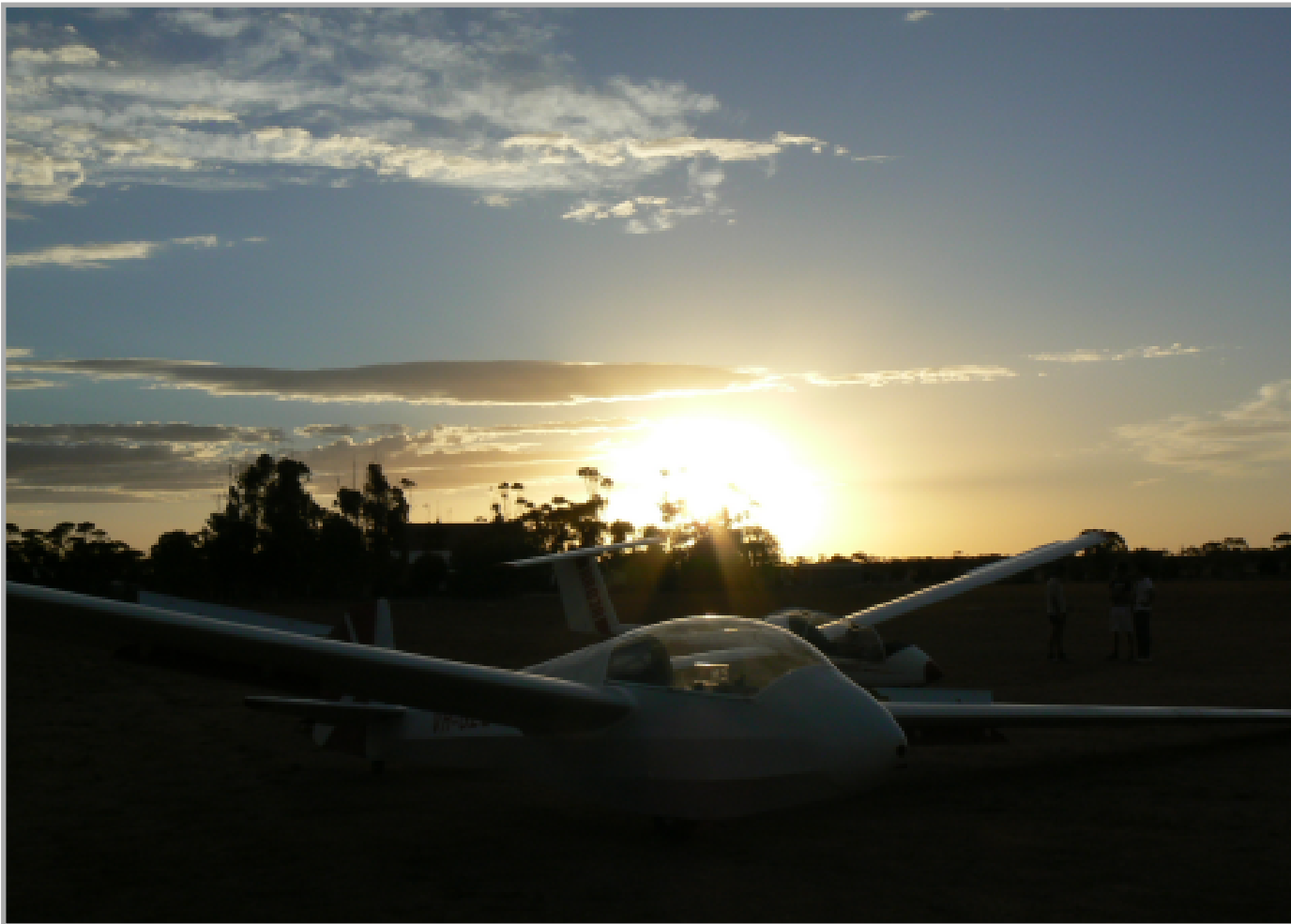
The end of a long day at Stonefield just before last flights.