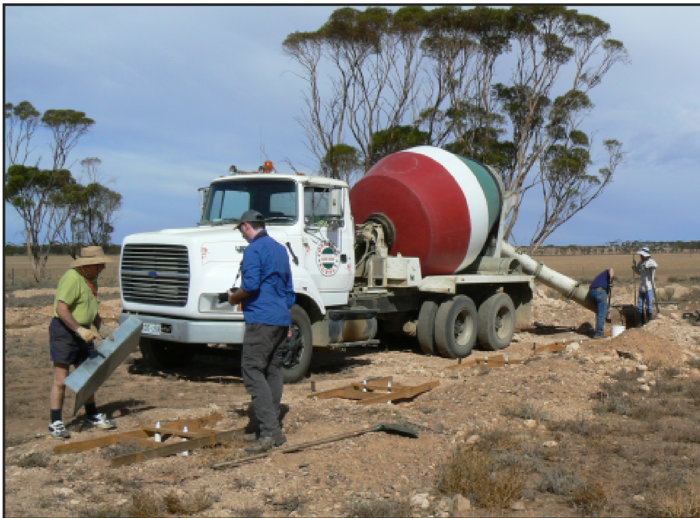
The Concrete Starts Flowing on the New Hanger...