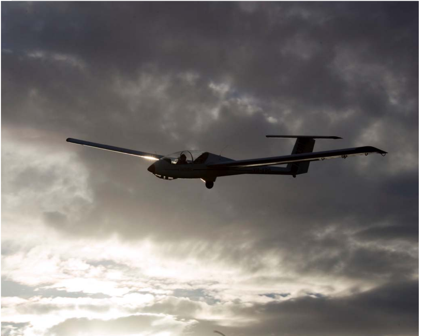
Not really a February picture, but it's pretty cool. I'm in the front seat waving after one of Derek's hangar runs.