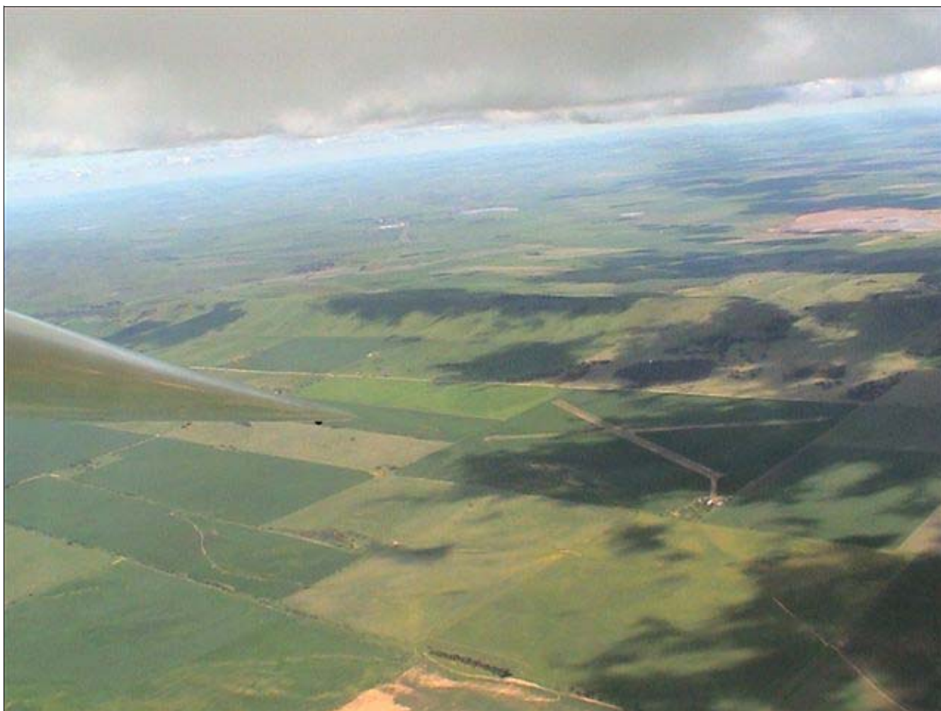
The airfield at Lochiel, as viewed from 4300 feet in GMI by Tom Wilksch on 5 September.