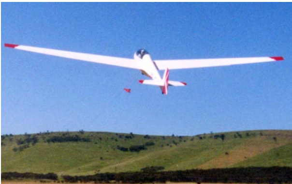
ZQ rotates into full climb on its maiden flight at Lochiel. Photo by Justine.

Well I can only say that October has been an incredibly busy month. There has been lots and lots of flying going on, even with the reduced number of aircraft available on field. Perhaps the warmer weather is coaxing people back out of their winter hibernation. The shed at West Beach has been all but frantic with both WVA and ZQ being readied for Khancoban as well as good progress on ZM's 30 yearly. Unfortunately all this activity has meant that we have deferred last months executive meeting as well as Part 2 of the strategic planning meeting and of course the newsletter is late. As a result I have cobbled together this partially completed newsletter and published it under the 'Far Cu' title. Of course I am probably the only editor to have 'Far Cu'd himself, usually it is someone else 'Far Cu'ing the editor for being extremely late with the next edition.