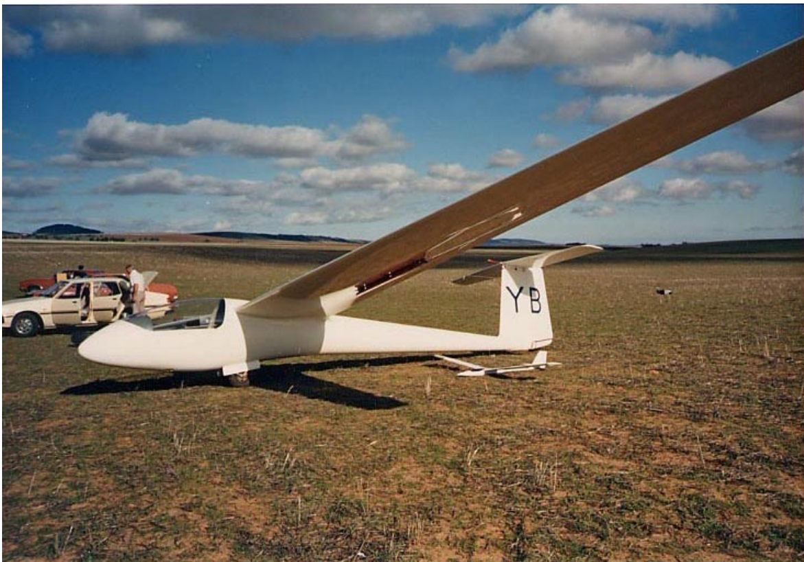
The Phoebus. Note the model glider next to it.

The next photograph shows the first fibreglass glider ever owned by the club. Our 17m open class Phoebus! The Phoebus was blessed with 42:1 performance, but at very slow speed only – but nothing could beat it on a weak day! It also had an all-flying tail – there is a big red lump of lead forward of