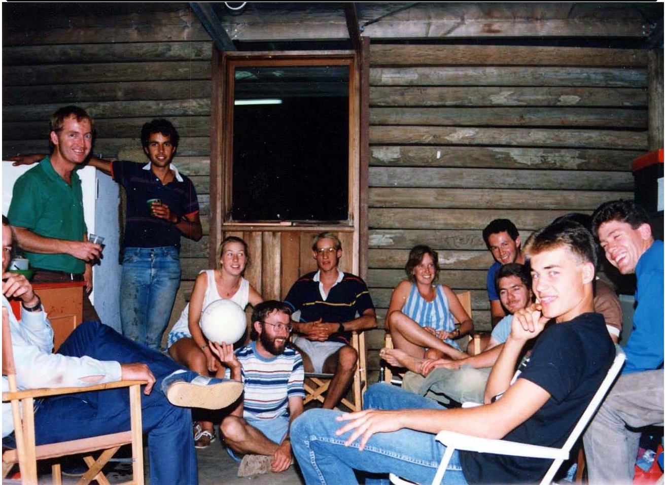
This months calendar photo is from the David Conway collection (taken in early 1986?)