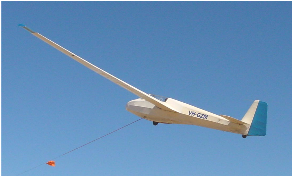
The Bergfalke going up the wire: Photo by David Conway

The Official Journal of the Adelaide University Gliding Club