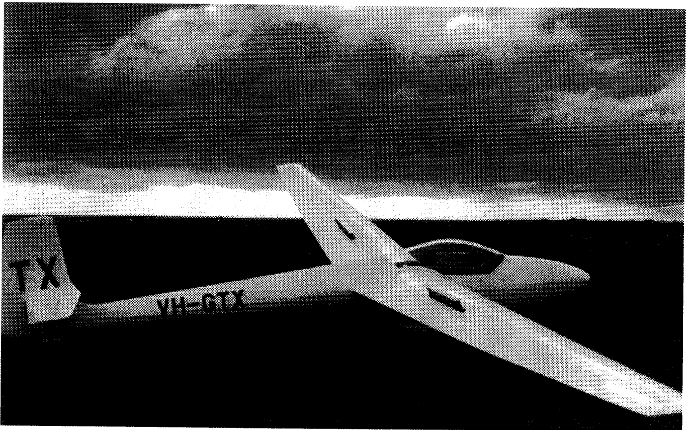
A Libelle similar to the club's... resting at Lochiel