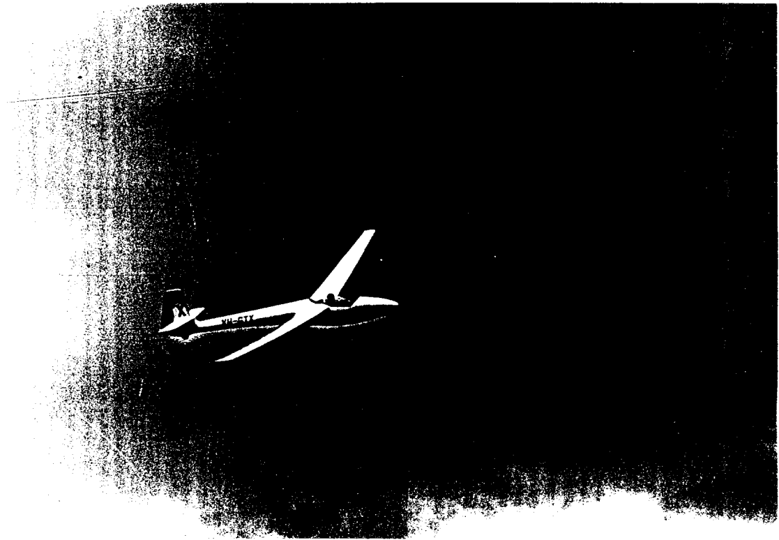
Libelle Tango X-Ray ridge soaring at Lochiel

Volume 17, Issue 3. May 1992. An Official Publication of the Adelaide University Gliding Club Inc.